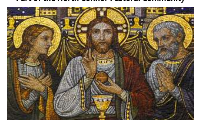
6 June 2021 The Most Holy Body and Blood of Christ CORPUS CHRISTI

Part of the North Connor Pastoral Community