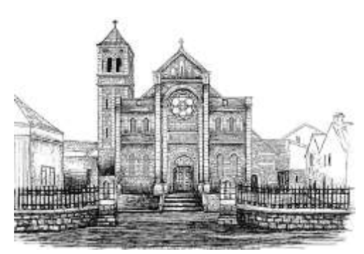
31st January 2021 Fourth Sunday in Ordinary Time Sunday B/Weekdays 1 Psalter week 4

Part of the North Connor Pastoral Community